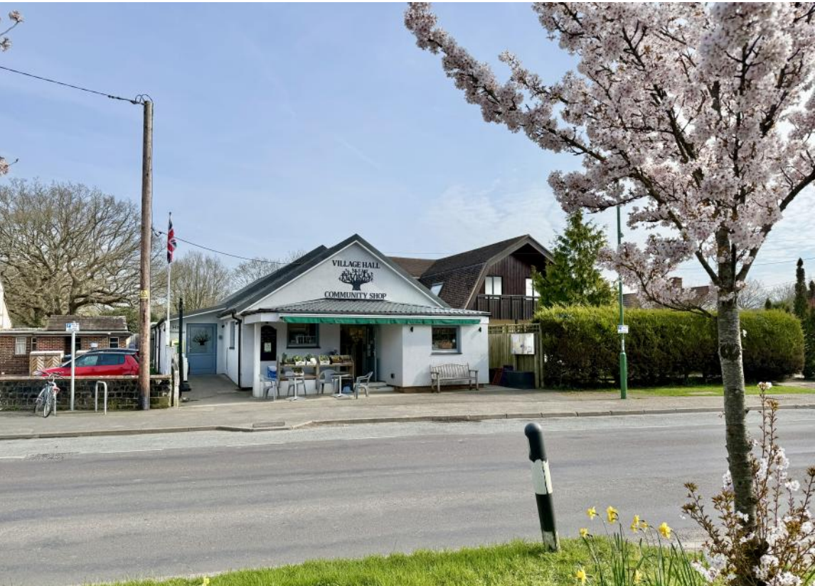
Village Hall & Community Shop, Sayers Common