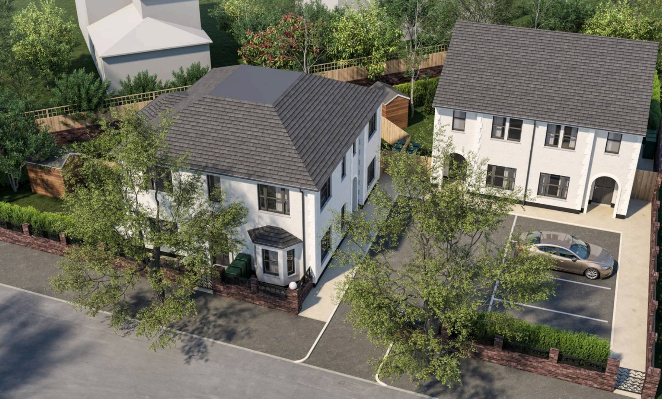
Plot 3 Green Gables, Ashley Road, Epsom Epsom