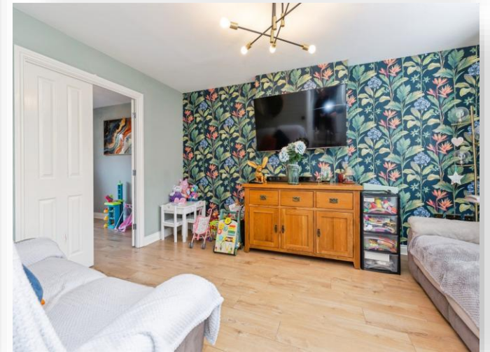
Orchid Road, Hartlepool, TS26 0AF