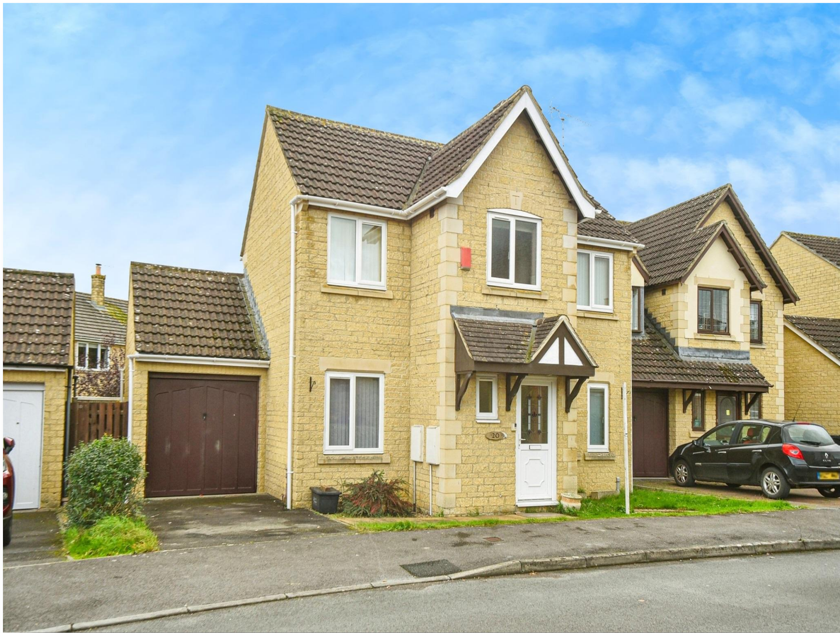
Riverside Drive, Chippenham SN15 3XS