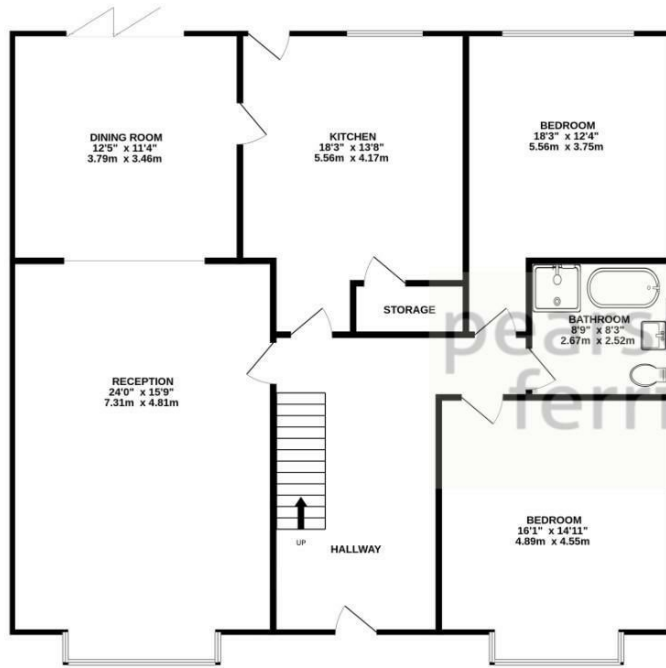
GROUND FLOOR 1472 sq.ft. (136.8 sq.m.) approx.