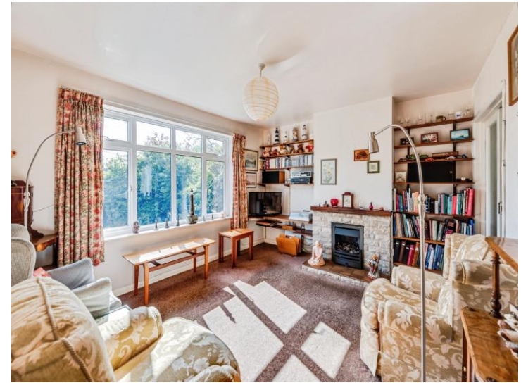
Eden Croft, Abingdon, OX14 1QJ