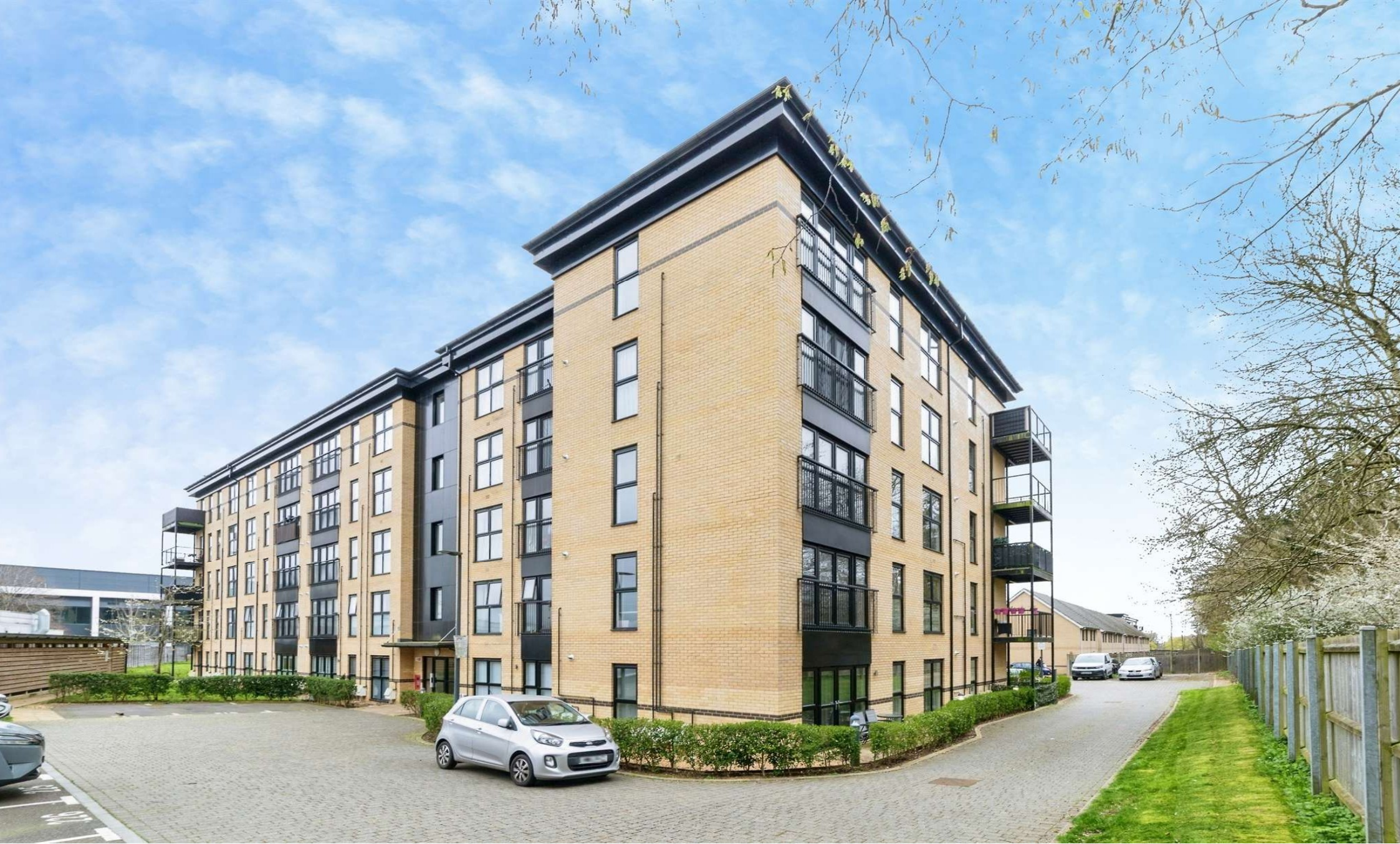
Shapiro House Giles Crescent, Stevenage SG1 4GW