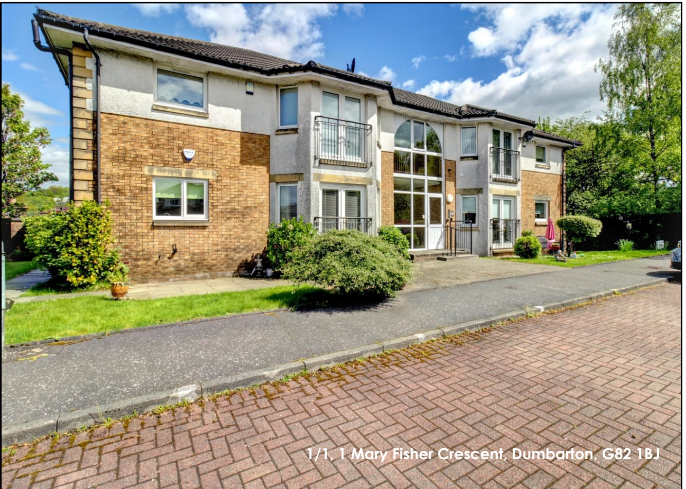
1/1, 1 Mary Fisher Crescent, Dumbarton, G82 1BJ

Set within one of Dumbarton's most desirable modern developments, this welcoming two-bedroom ground-floor apartment combines generous proportions with thoughtful design and exceptional everyday convenience.