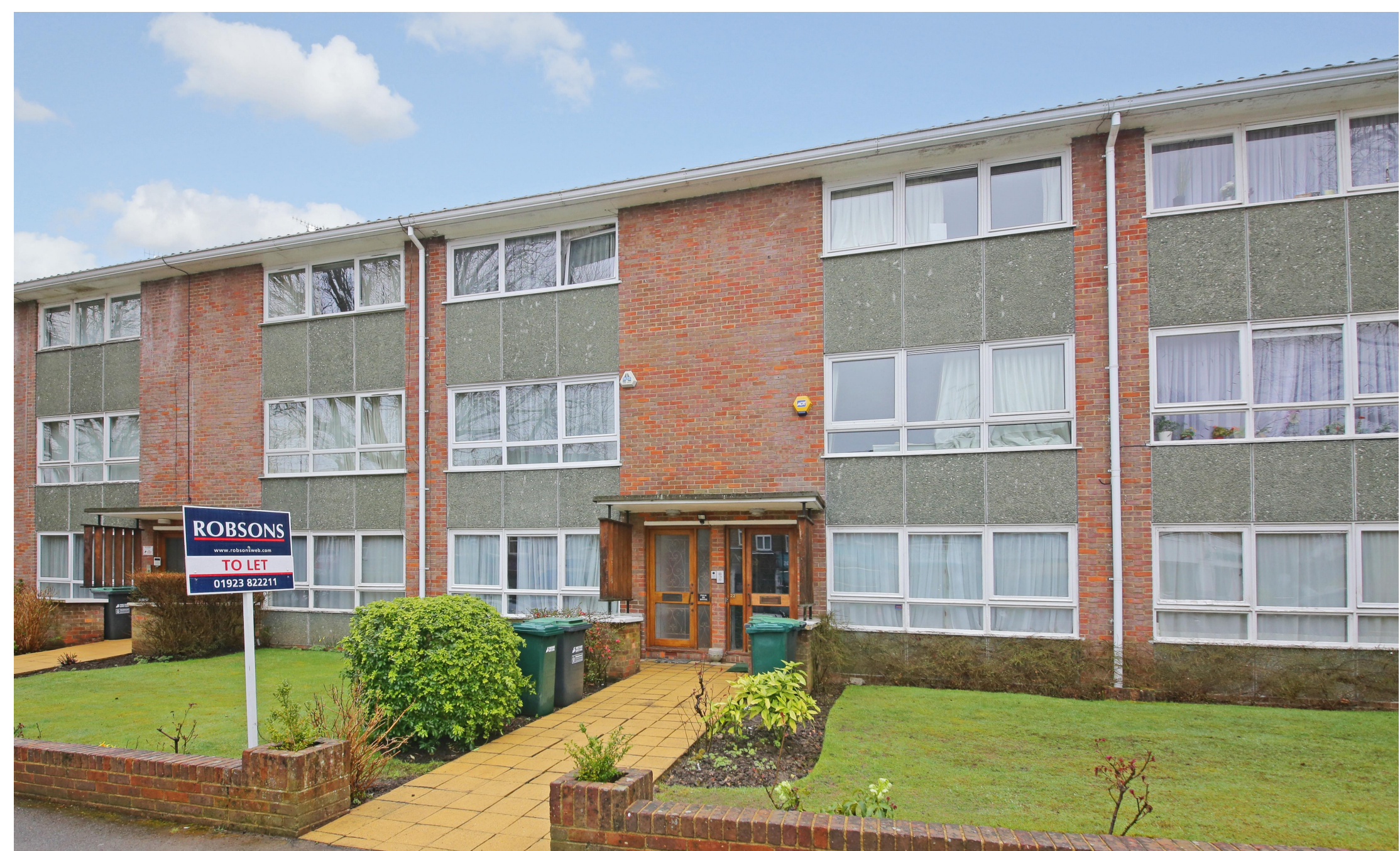
A three bedroom, two bathroom duplex apartment Penn House, Moor Park, Northwood, Middlesex HA6 2HH