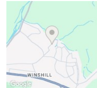
Illustration for identification purposes only, measurements are approximate and not to scale, unauthorized reproduction is prohibited.

Approx. Gross Internal Floor Area 1,609 sq. ft / 149.49 sq. m