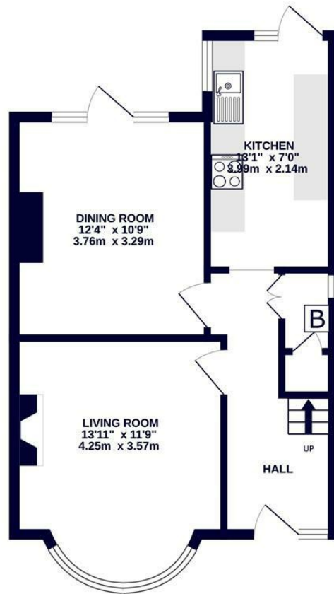
GROUND FLOOR 455 sq.ft. (42.3 sq.m.) approx.