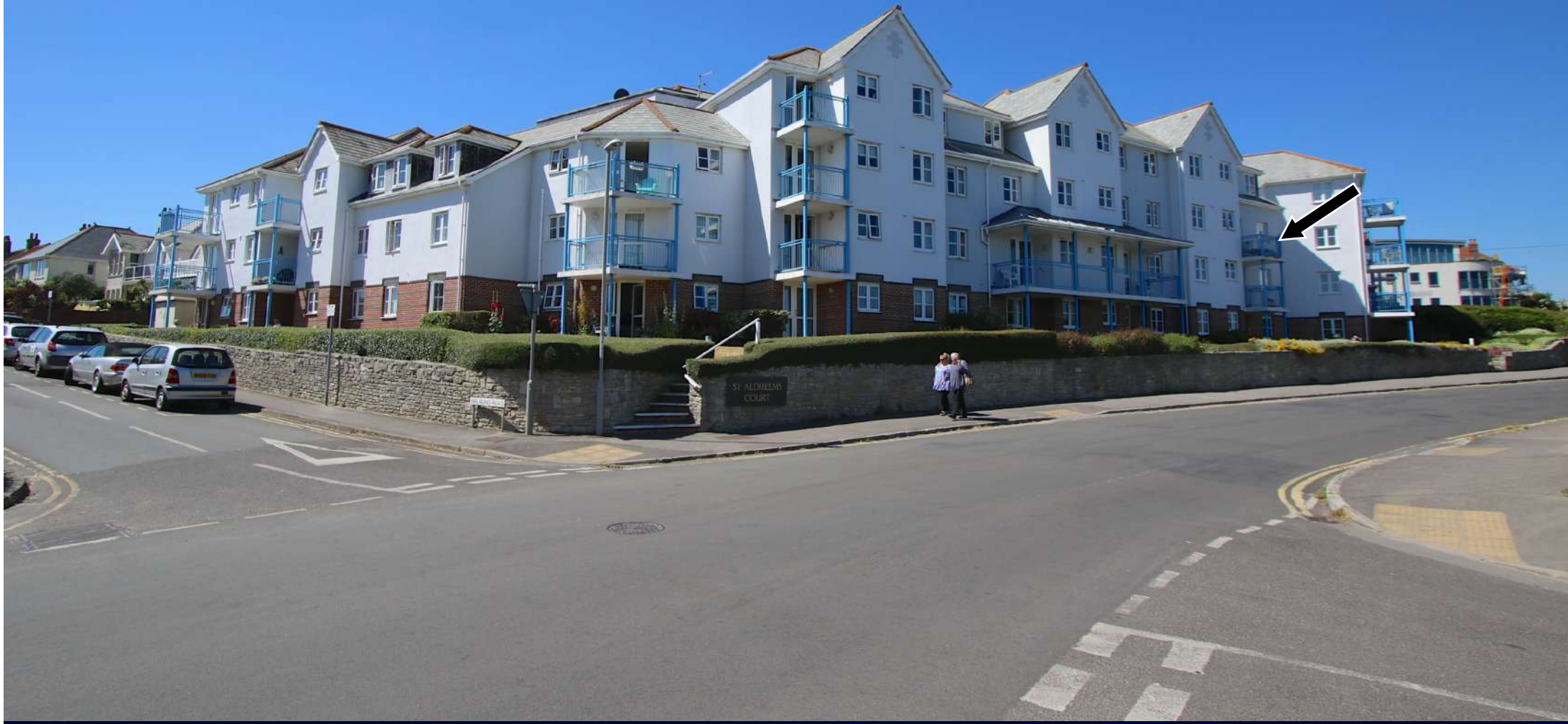
45 ST. ALDHELMS COURT, DE MOULHAM ROAD, SWANAGE £335,000 Leasehold