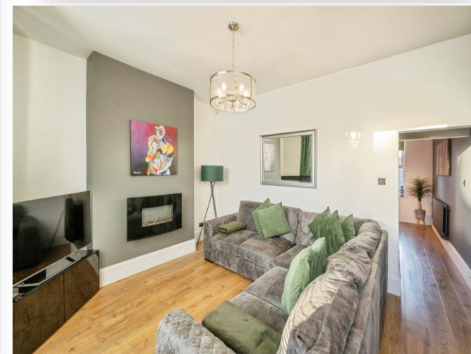
Silverwood View, Conisbrough Doncaster DN12 2NU