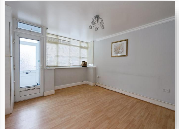
Ground Floor Flat Sompting Road, LANCING BN15 9LG