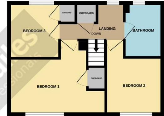
TOTAL FLOOR AREA : 76.2 sq.m. (820 sq.ft.) approx.

Whilst every attempt has been made to ensure the accuracy of the floorplan contained here, measurements of doors, windows, rooms and any other items are approximate and no responsibility is taken for any error, omission or mis-statement. This plan is for illustrative purposes only and should be used as such by any prospective purchaser. The services, systems and appliances shown have not been tested and no guarantee as to their operability or efficiency can be given. Made with Metropix ©2025