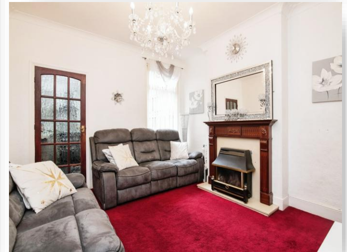
Marlborough Road, Smethwick B66 4DW