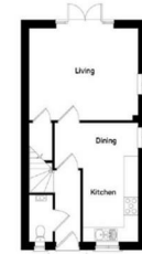
Ground Floor KITCHEN / DINING 4.97m x 3.50m 16'3" x 11'8" LIVING 4.59m x 3.85m 15'0" x 12'7"