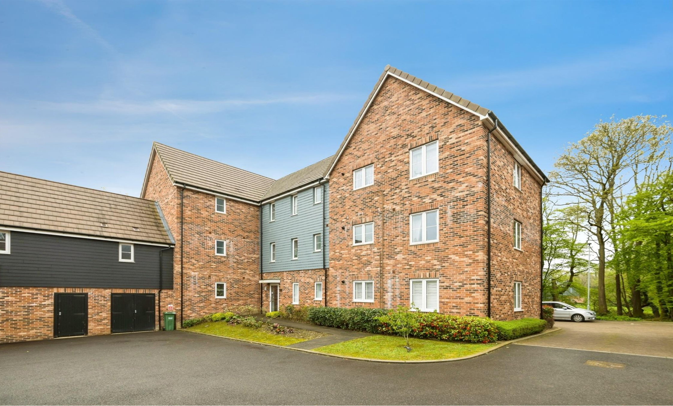
Unicorn Way, Burgess Hill RH15 0UU