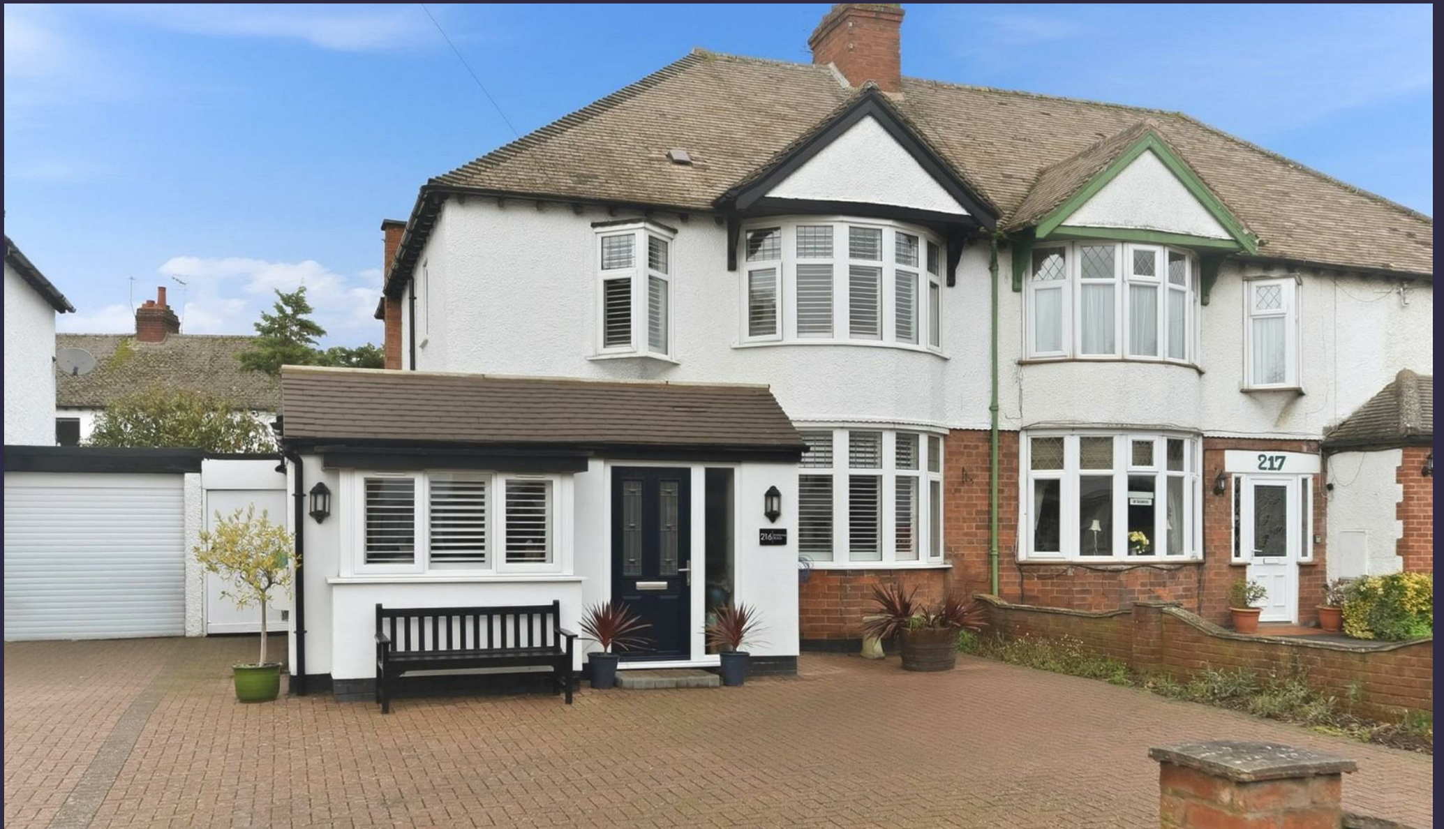
216 Evesham Road, Stratford-upon-Avon, CV37 9AS