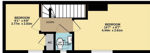
1ST FLOOR 244 sq.ft. (22.6 sq.m.) approx.