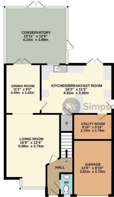
GROUND FLOOR 866 sq. ft. (80.5 sq m.) approx.