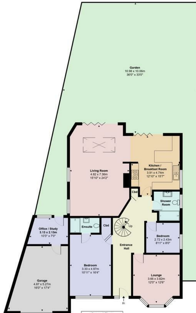
Ground Floor Area: 150.4 m 2 ... 1619 ft 2