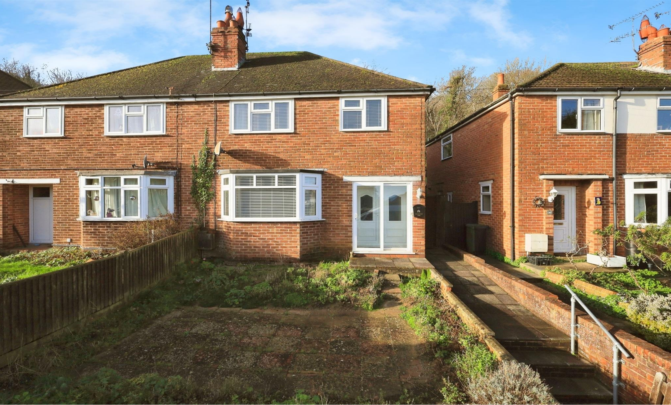
Cherry Garden Road, Eastbourne BN20 8HF