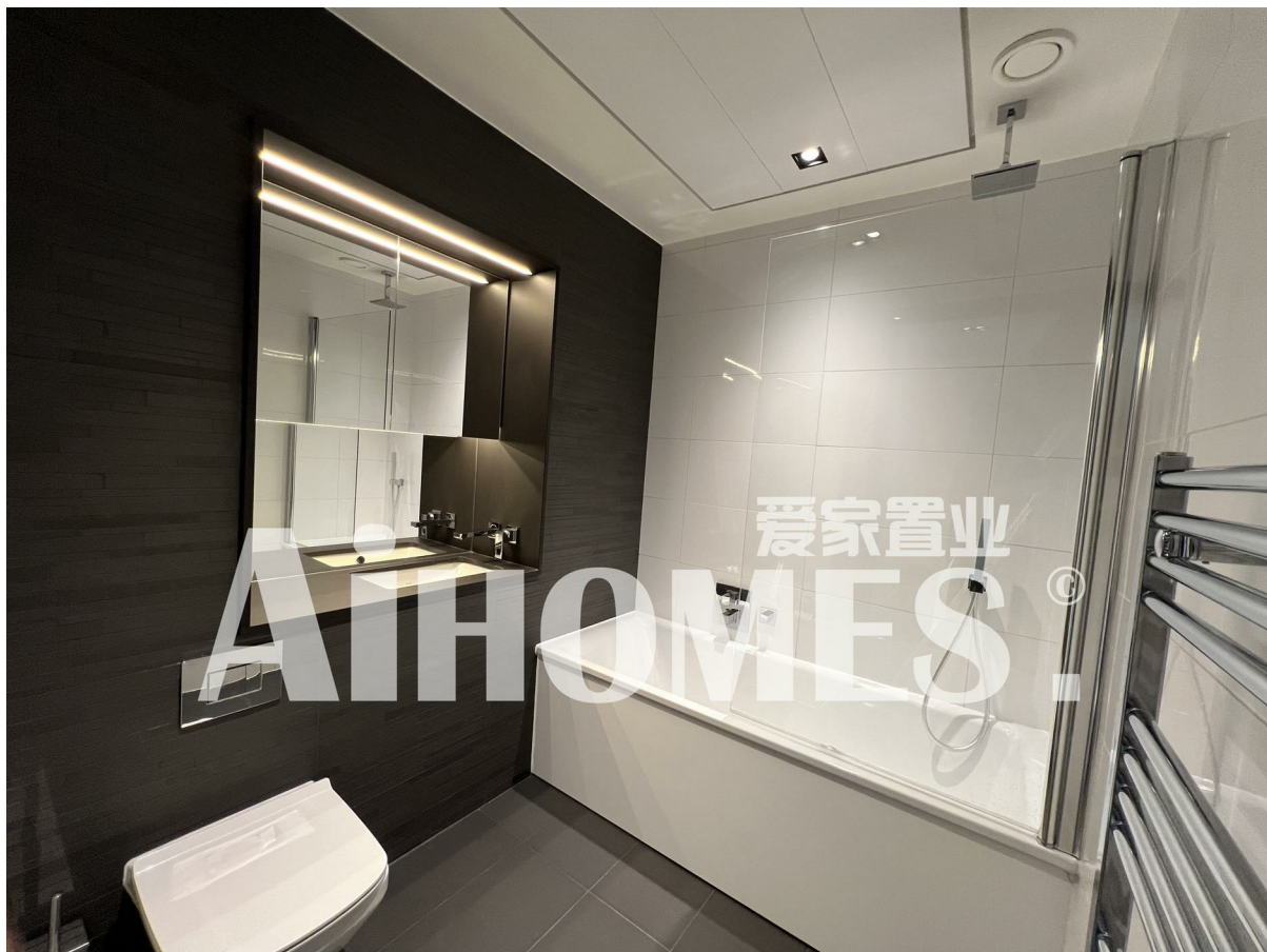
Luxury 1B1B Apartment | Amory Tower | Canary Wharf E1411 28225AMT