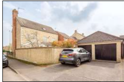
Garage and Parking