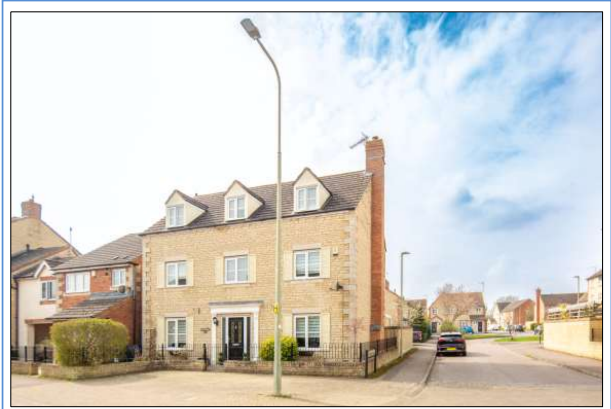
'The Willows', 64 Mallards Way, New Langford, Bicester, Oxfordshire. OX26 6WT