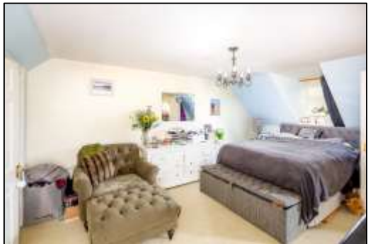
Second Floor Bedroom Two