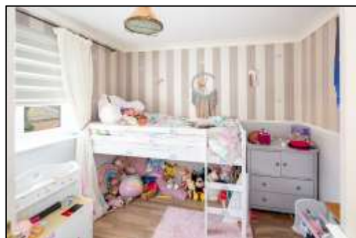
First Floor Bedroom Five