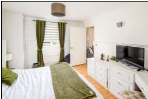
First Floor Bedroom One