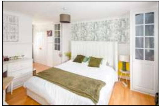
First Floor Bedroom One