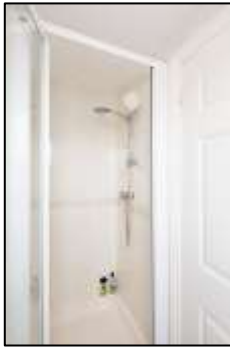
Jack-n-Jill Bathroom to Second Floor