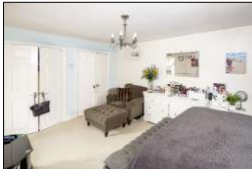
Second Floor Bedroom Two