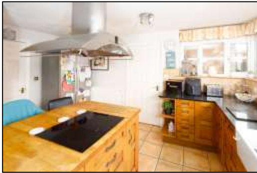
Kitchen Breakfast Room