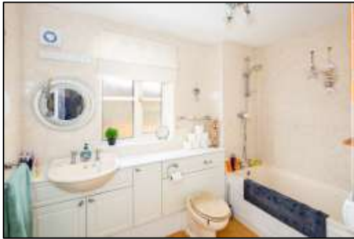
First Floor Bathroom