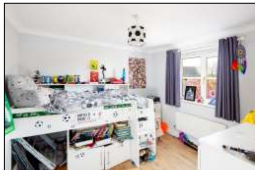
First Floor Bedroom Four