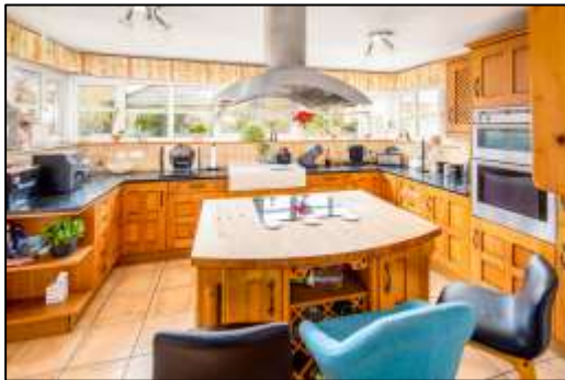
Kitchen Breakfast Room