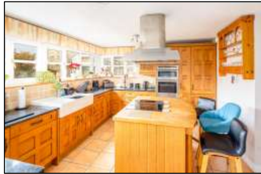
Kitchen Breakfast Room