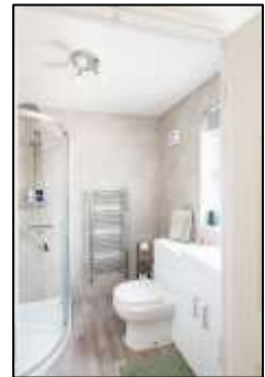
Wardrobes and En-Suite to Bedroom One