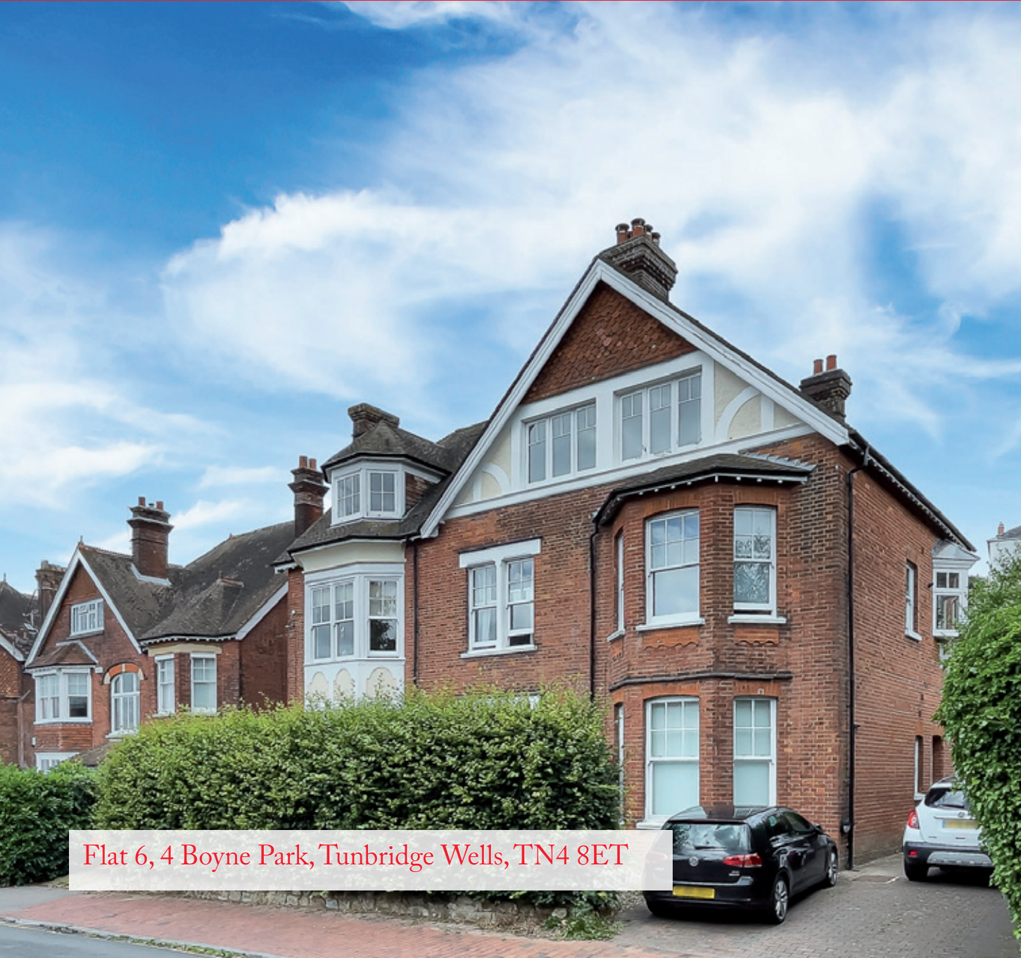
Flat 6, 4 Boyne Park, Tunbridge Wells, TN4 8ET