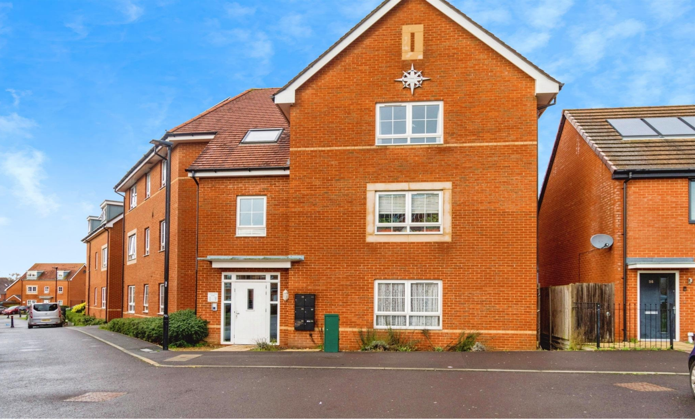
Charles Arden Close, SOUTHAMPTON SO16 4HS