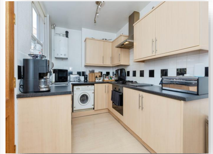
Barclay Street, Leicester LE3 0JE