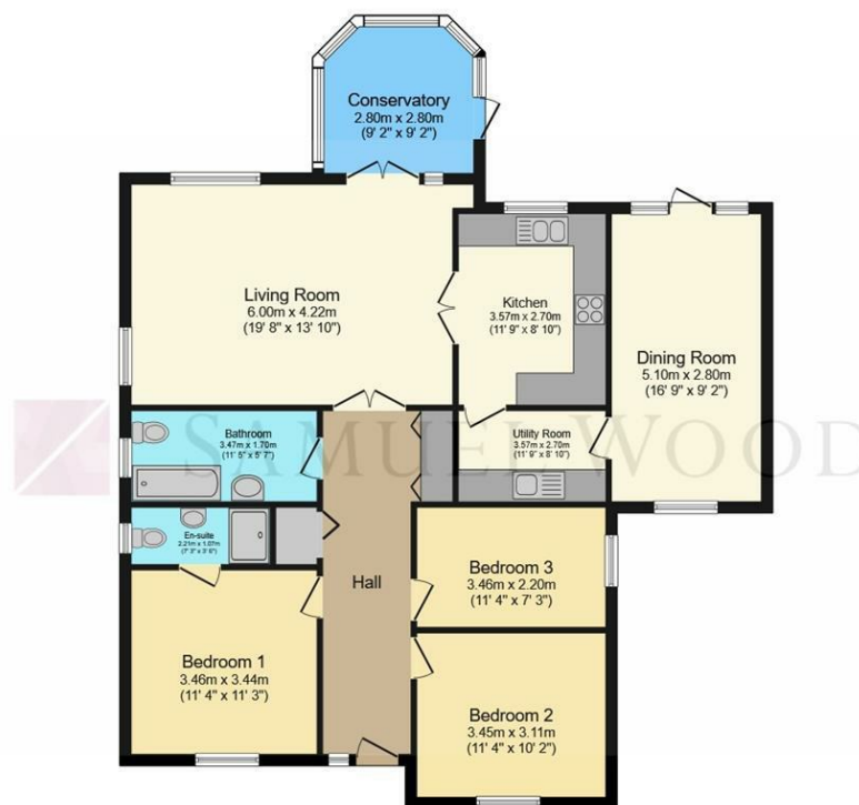
Floorplan Floor area 119.0 sq.m. (1,281 sq.ft.)

Total floor area: 119.0 sq.m. (1,281 sq.ft.)