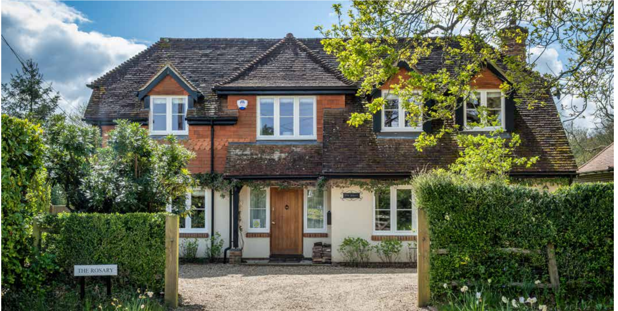
THE ROSARY, RICKMANS LANE, PLAISTOW