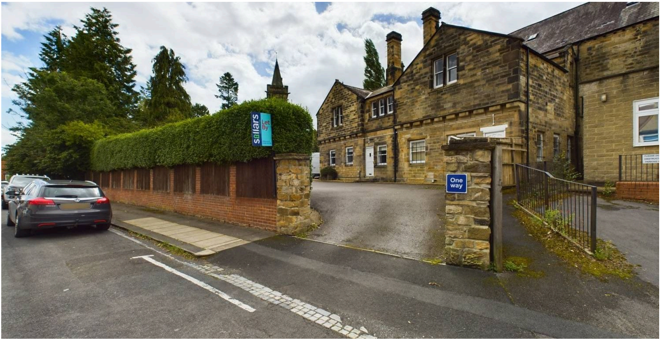
Tower House, Tower Road, Darlington Darlington