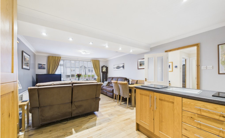
Living Room / Dining Kitchen