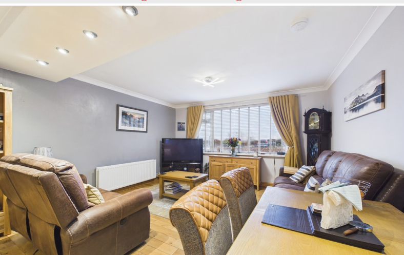
Living Room / Dining Kitchen