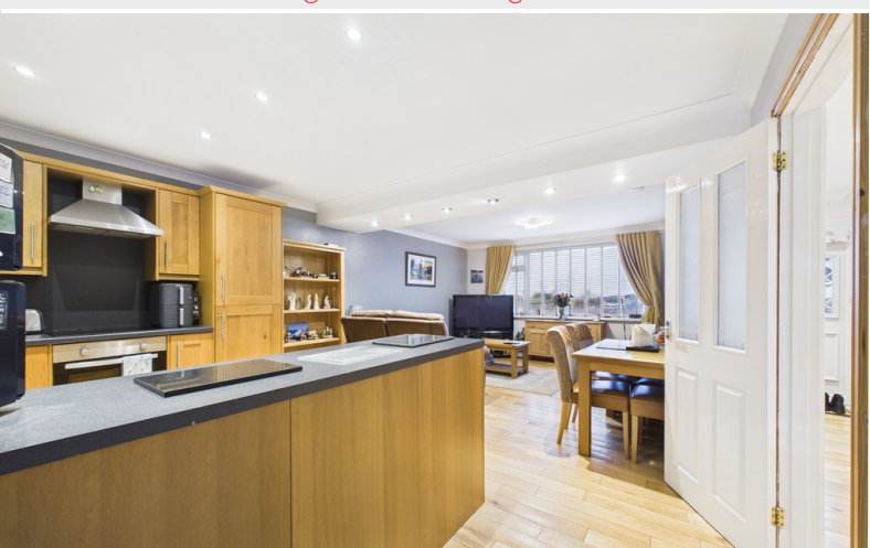
Living Room / Dining Kitchen