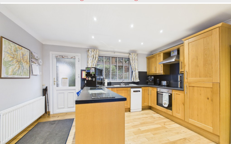
Living Room / Dining Kitchen