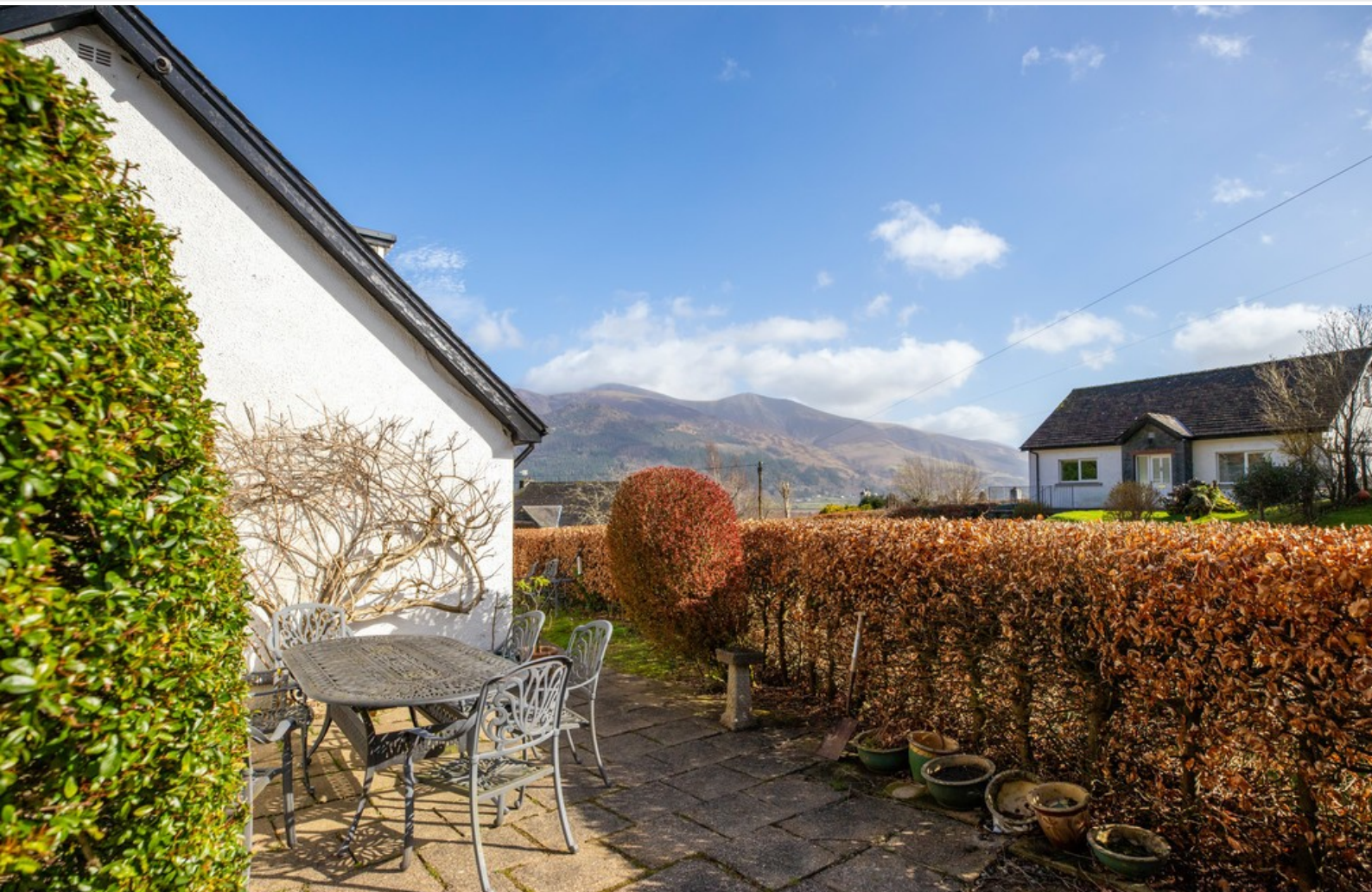
Outside Seating Area