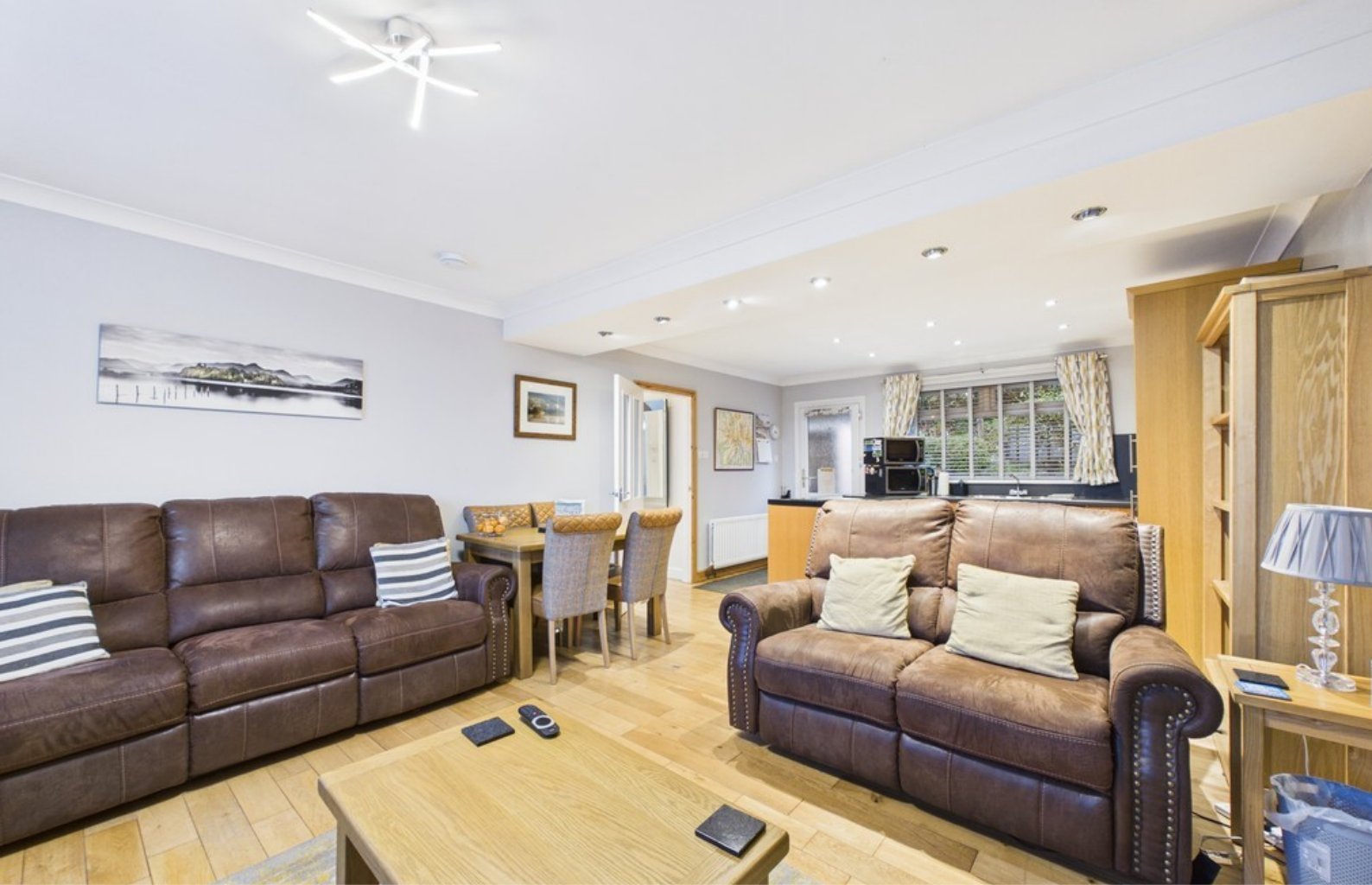
Living Room / Dining Kitchen