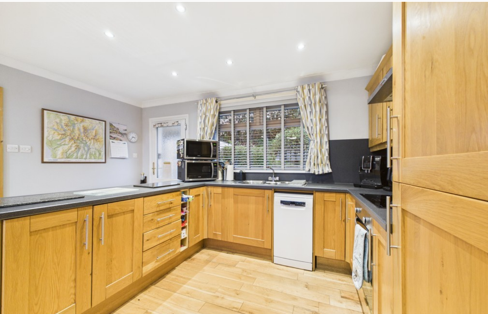
Living Room / Dining Kitchen