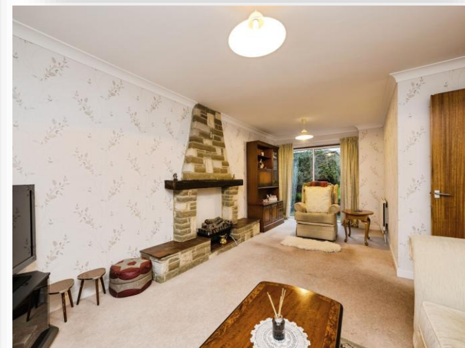
St. Marys Road, Stilton Peterborough PE7 3RX