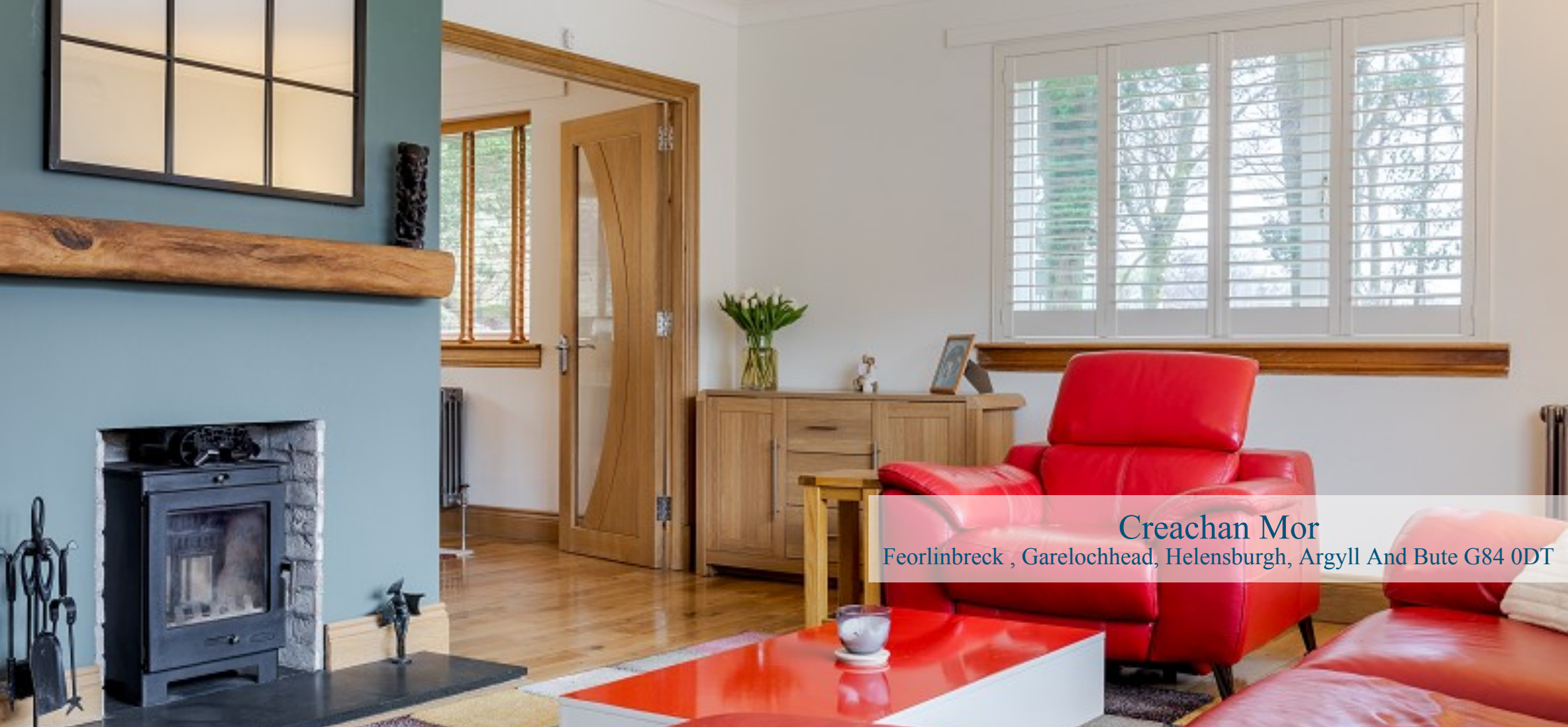
Creachan Mor Feorlinbreck , Garelochhead, Helensburgh, Argyll And Bute G84 0DT