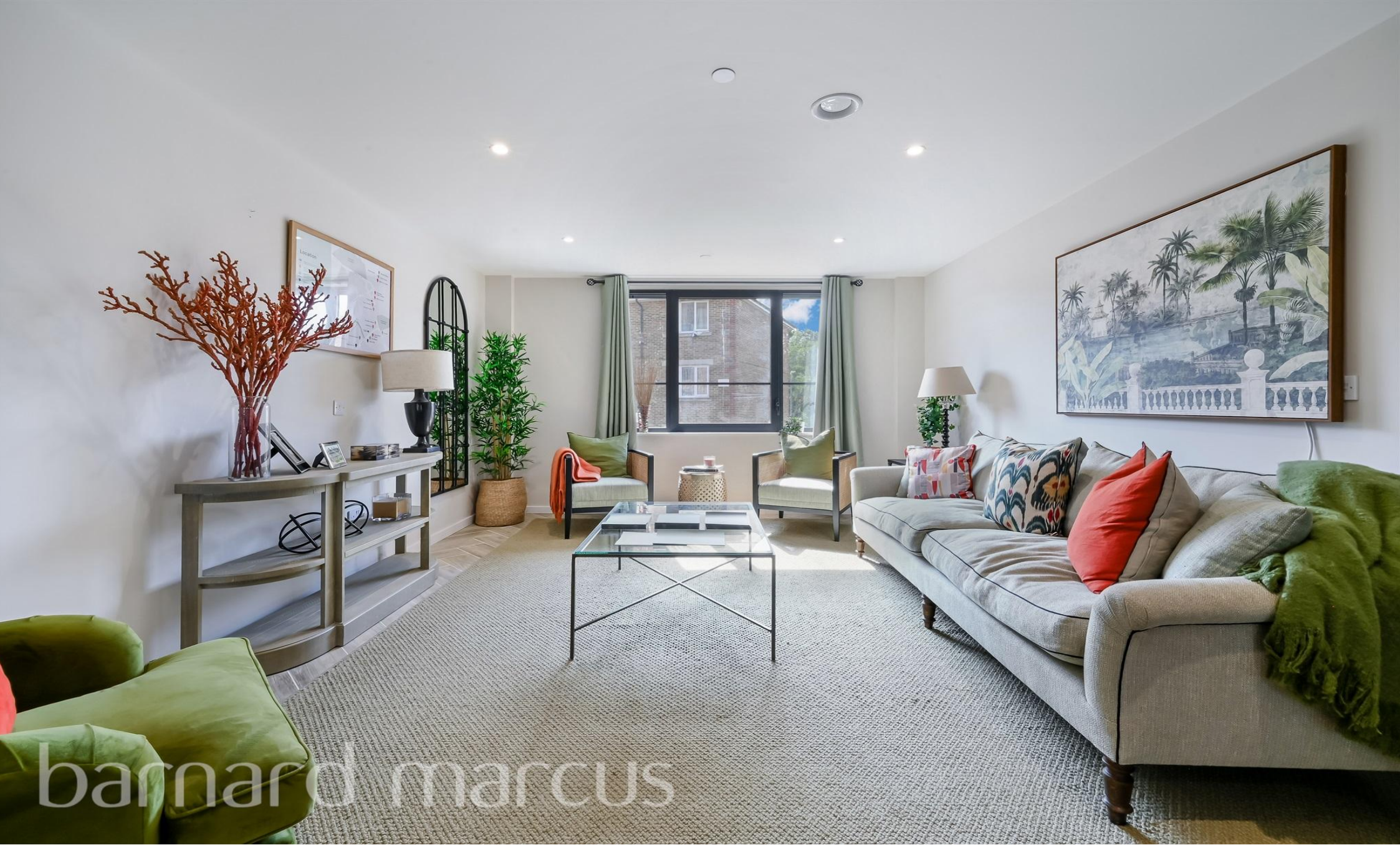
Meadow House Fallsbrook Road, London SW16 6DY