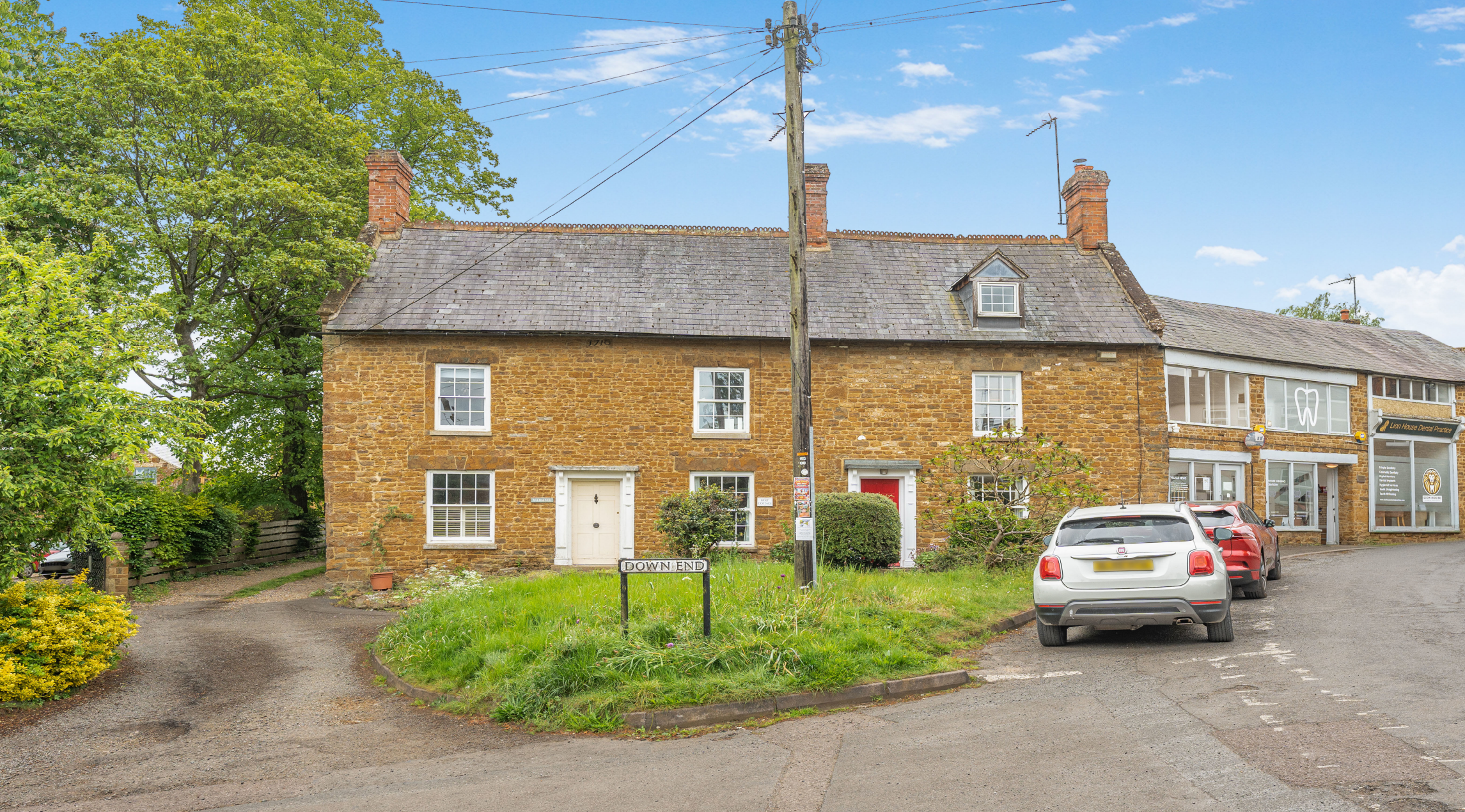
Holt Cottage, High Street Hook Norton, OX15 5NF