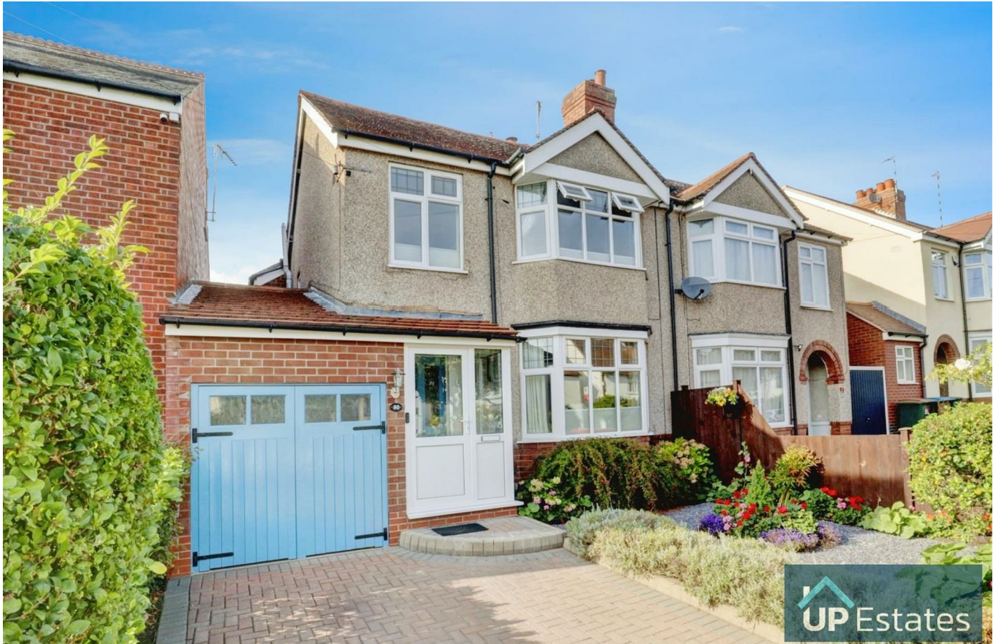
Beanfield Avenue, Coventry