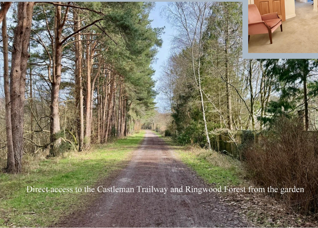
Direct access to the Castleman Trailway and Ringwood Forest from the garden