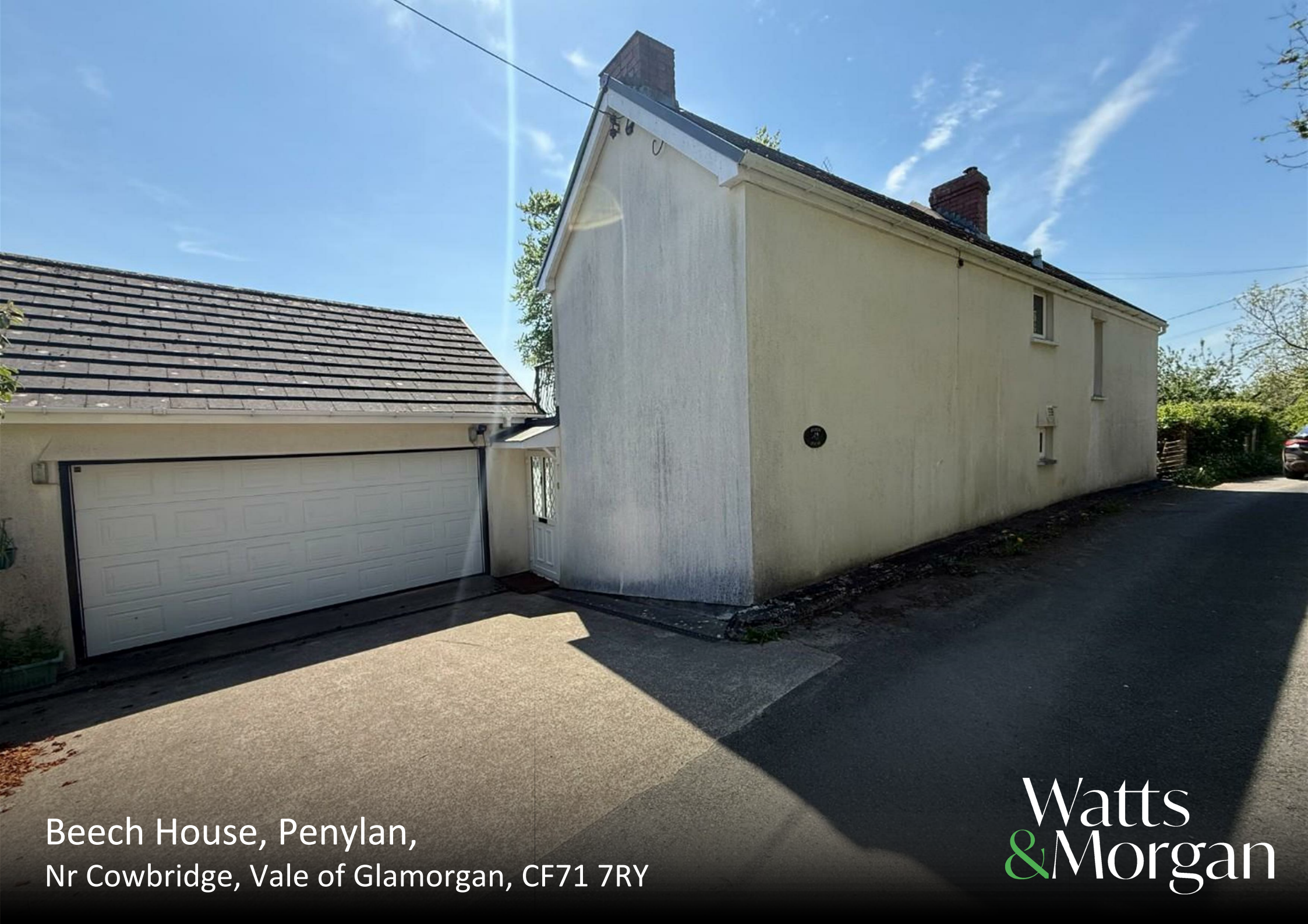
Beech House, Penylan, Nr Cowbridge, Vale of Glamorgan, CF71 7RY