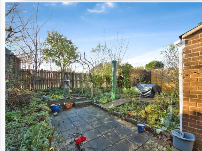
6 Barnard Court, Charter Way, Wells, BA5 2FJ