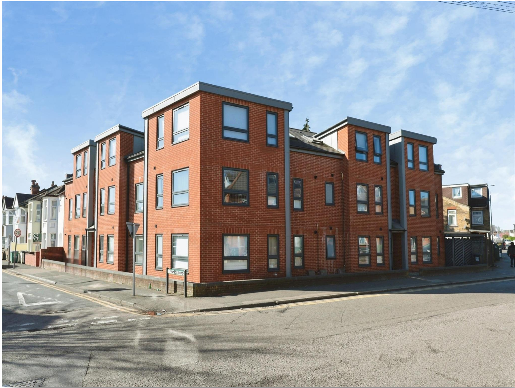
Forester House, Marlborough Road, Watford, WD18 0QD