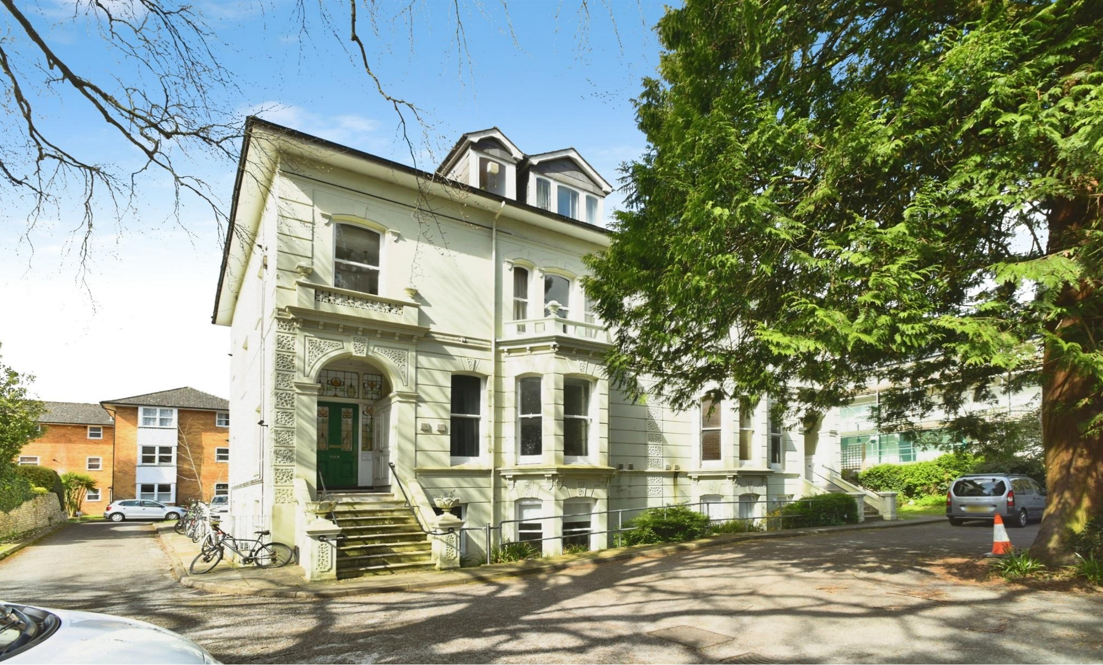
Carlton House, Preston Road, Brighton, BN1 6SE