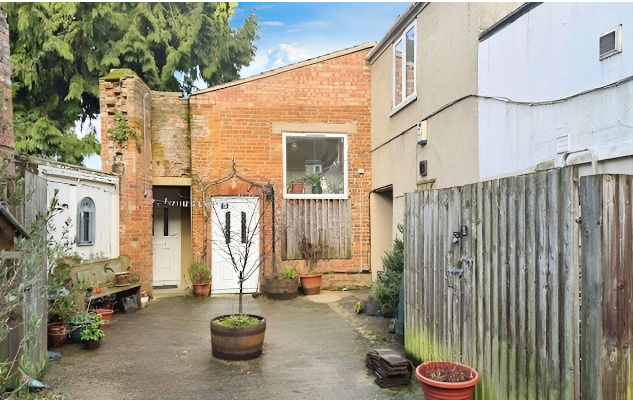
The Old Workshop, Warminster