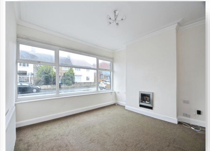
King Edwards Drive, Harrogate HG1 4HB