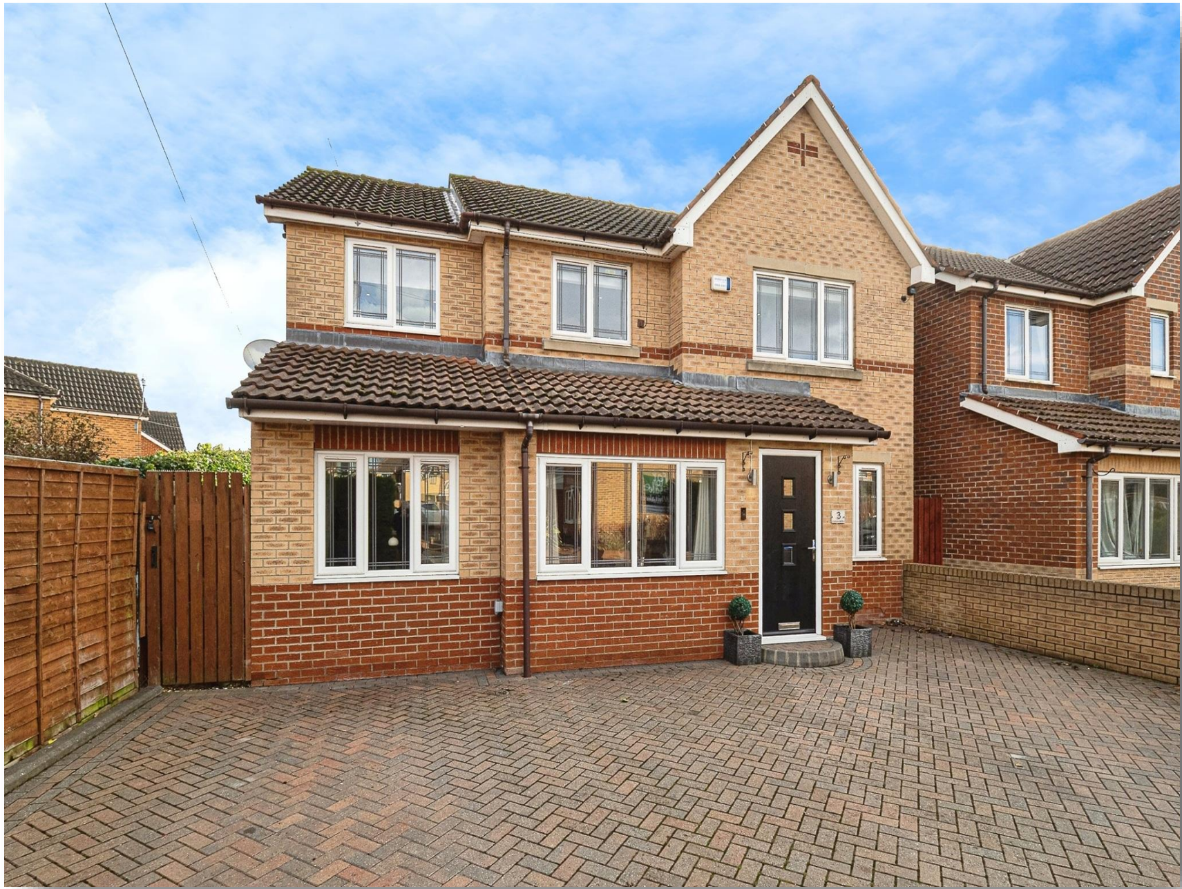
Highgrove Way, Kingswood, Hull, HU7 3JU