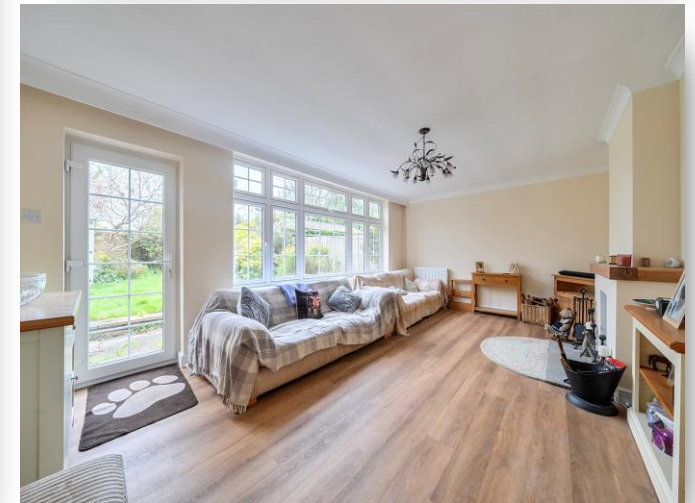
Thickets, Burchetts Green Lane, Burchetts Green, Maidenhead SL6 3QW