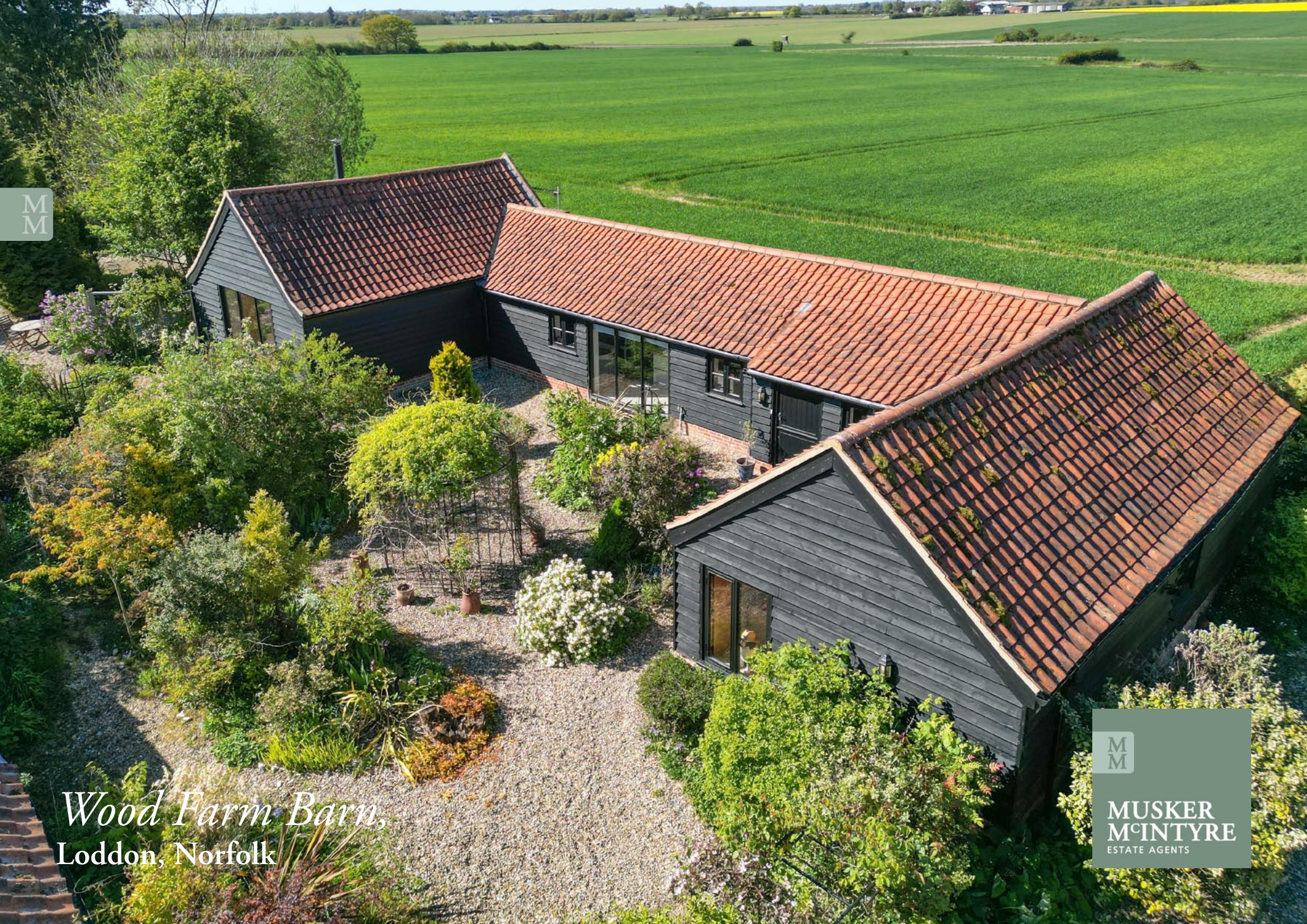
Wood Farm Barn, Loddon, Norfolk