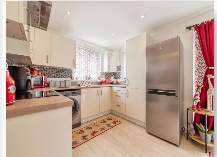
Gilberts Field, North Muskham Newark NG23 6NE