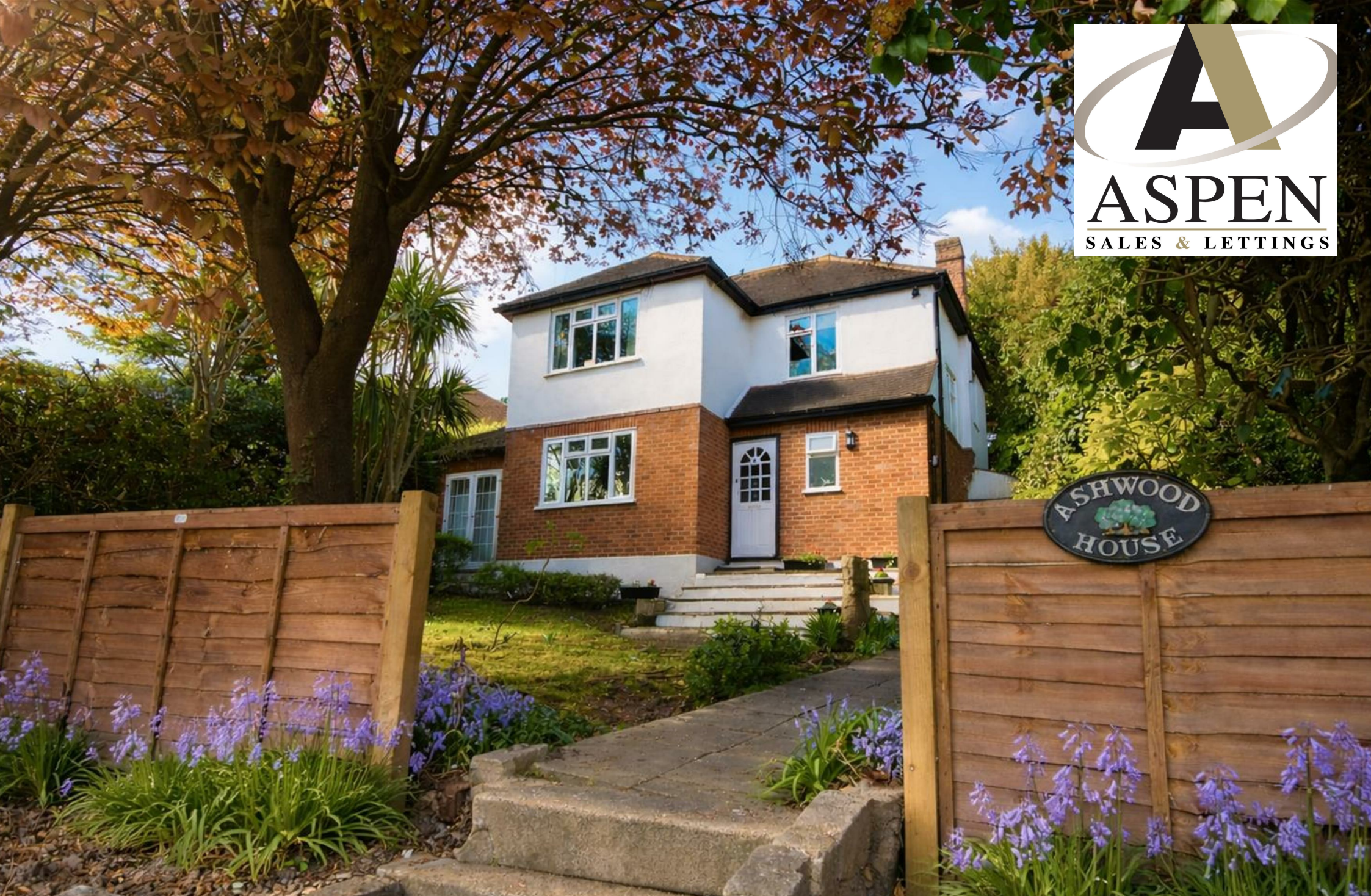
Ashwood House Mount Lee, Egham, TW20 9PD