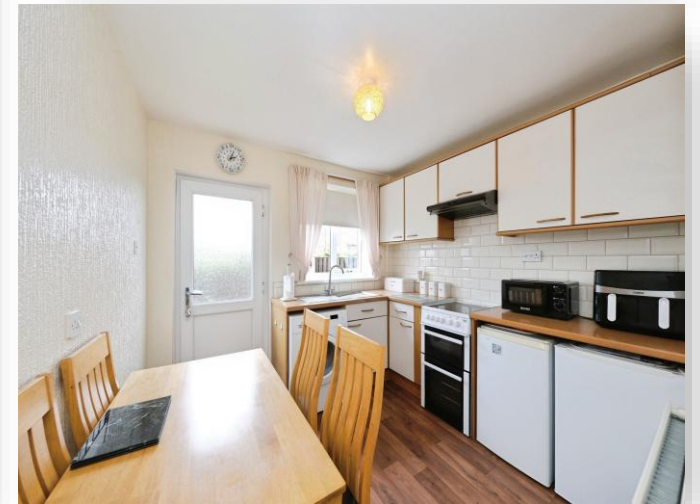
Daylands Avenue, Conisbrough DONCASTER DN12 2NS